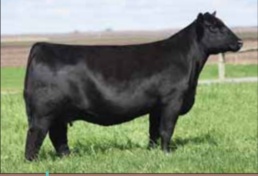
PVF PROVEN QUEEN 4032, DAM OF LOT 17