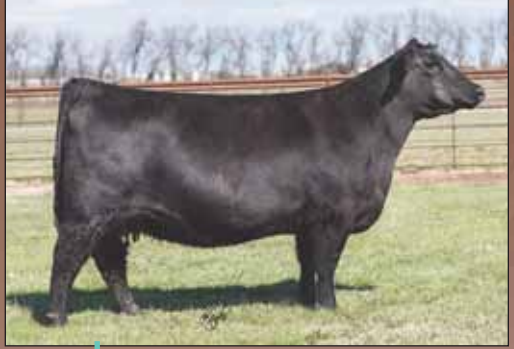
PVF MISSIE 3078, DAM OF LOT 25