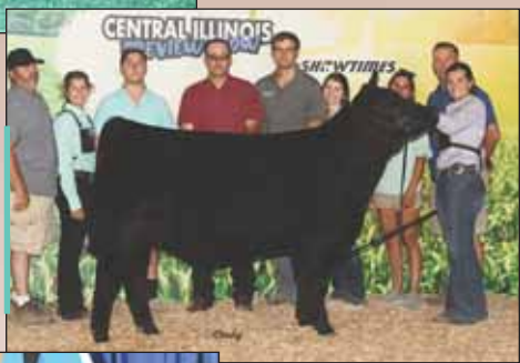
PVF PROVEN QUEEN 9126, Reserve Division Winner from the 2020 NJAS is a daughter of PVF Proven Queen 3033.