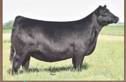
PVF MISSIE 6311, DAM OF LOTS 23 & 24