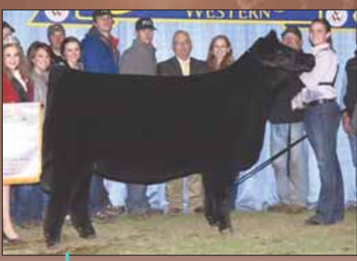
PVF MISSIE 4149, DAM OF LOTS 21 & 22