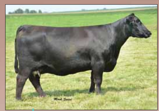
PVF MISSIE 1148, DAM OF LOT 26.