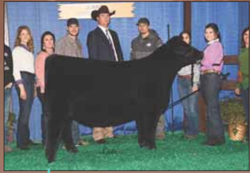
PVF PROVEN QUEEN 8256, FULL SISTER TO LOT 19