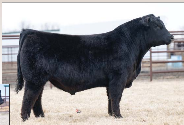
PVF DLX King Pin 0058, sire of Lot 53.