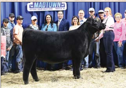
PVF Proven Queen 3025, the Fourth Overall Heifer at National Junior Angus Show is a full sister to the dam of Lots 21-23.

What is sure to be a feature sale night, this October born daughter out of Casino shows all the depth and power and rib shape that we hope to get from a Casino sired female, with the eye-catching look of her mom. Casino crossed on this Marvel daughter from the Proven Queen cow family has created an incredibly powerful show and donor prospect.