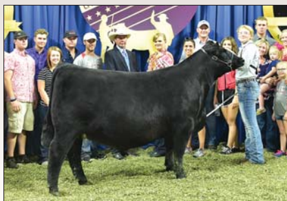
PVF Blackcap 6313, this Fourth Overall National Junior Show Champion is a maternal sib to the dam of Lots 4-6.

Lot 5 represents a full sister to PVF Blackcap 4075, the $100,000 sale feature of our Fall 24 Production Sale to the Griswold family. Good Times progeny are becoming increasingly dominant in the show ring, and as our first daughters entered production last year, they are proving their worth as producers. Good Times two-year-olds dominated our donor pen last spring, including PVF Blackbird 2201, who produced the first three lots in this sale. 4150 is a massively constructed, huge ribbed maternal looking female who will surely be a favorite sale night.