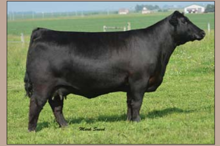
PVF Blackbird 3070, dam of Lot 45