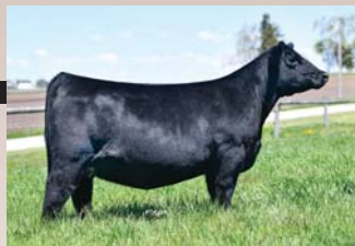
PVF Proven Queen 8256