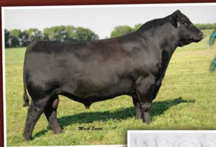
P/F All Payday 729