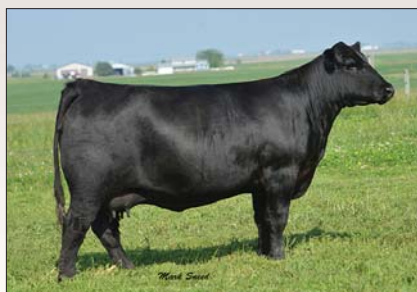
PVF Proven Queen 2106, the famous foundation Proven Queen donor is the granddam of Lot 25.