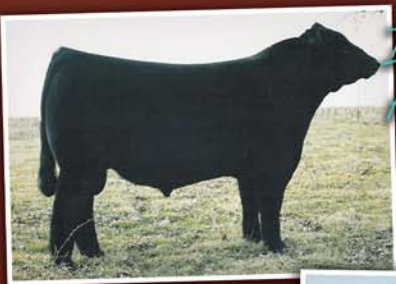
Dameron P/F Raptor 702