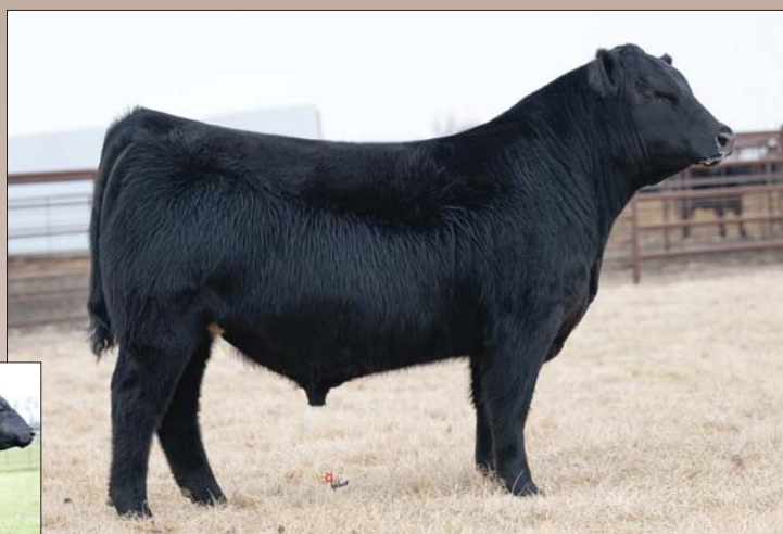
BOYD/MYERS Mindset M750, sire of Lot 52.