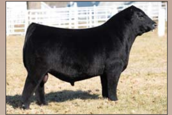
BNWZ Dignity 8017, sire of Lot 9.

Mating the many time champion and proven producer PVF Missie 6228 to with one of Insight's most powerful sons, BNWZ Dignity 8017 offers a pedigree line bred to PVF Missie 790, who is the dam of such PVF legends as PVF Insight 0129, PVF Missie 0084 and PVF Missie 1148. This female is built for the long haul. Her impeccable structure, rib shape and femininity will make her competitive this summer and beyond.