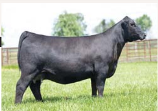
PVF Blackbird 2201