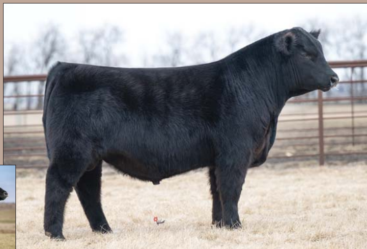
BLC/MLA Omega 2258, sire of Lot 51.