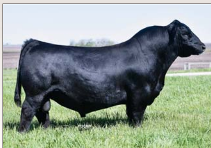
PVF Blacklist 7077, this ST Genetics many time sire of champions is the sire of Lot 1.