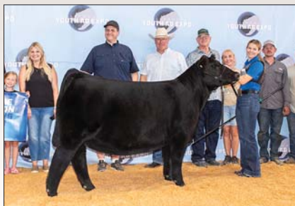
PVF Proven Queen 3034, the Supreme Champion of the California Youth Expo for Cambria Cook is a full sib to Lots 13-14.

Retaining 1/2 embryo interest in Lots 13 & 14.