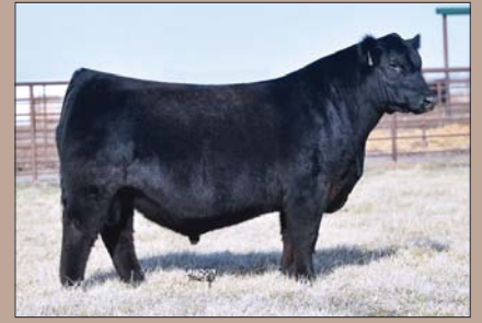
PVF DLX King Pin 0058, maternal brother to Lot 47.