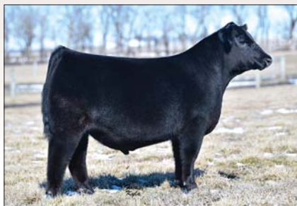
PVF Marvel 9185, this Select Sires sensation is the sire of Lots 17-18.

Lots 17 and 18 represent full sisters to PVF Lucy 1056, donor dam of Lots 15 and 16 in this sale and one of the winningest heifers in memory for Braxton Cole of Texas. The Lucy cow family has not only produced champions at nearly every major show but a maternal sister to WB PVF Lucy 1052 also produced PVF DLX King Pin 0058, one of the most popular young sires in the Angus breed.