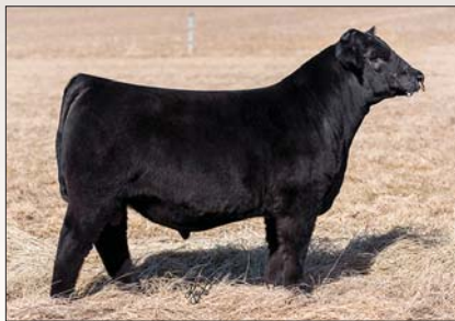
PVF Inauguration 6174, maternal grandsire of Lots 4-6.