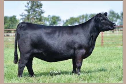
PVF Missie 6298, dam of Lot 34.