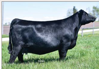
PVF Lucy 4189, the dam of King Pin is a maternal sister to the dam of Lots 17-18.