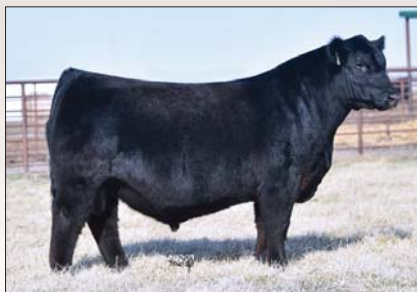
PVF DLX King Pin 0058, the sire of Lot 4.