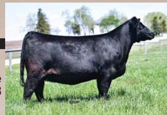
PVF Missie 6228

Sibs to Lots 7 - 10 from this now deceased donor.