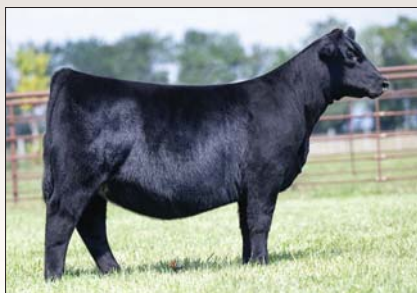
PVF Proven Queen 4212, this popular Lot 1 in our Fall Production Sale is a maternal sib to Lots 11-14

Combining the power of the Proven Queen cow family with the show stopping presence of the Omega sire, Lot 11 is sure to carry on the lineage of her family. BLC/MLA Omega 2258 was the extremely popular $190,000 valued live lot from the 2023 Embryos on Snow Sale. She is bred top and bottom to our Proven Queen cow family, and such program legends as Proven Queen 615, 010 and 602 can be found on both sides of her pedigree. 4137 exhibits the incredible look and presence that we expected from Omega with the raw power demonstrated by the Proven Queens. Retaining 1/2 embryo interest in Lot 11.