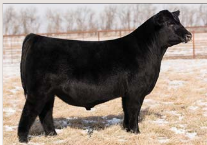
PVF The Natural 7042, maternal brother to the dam of Lot 2.