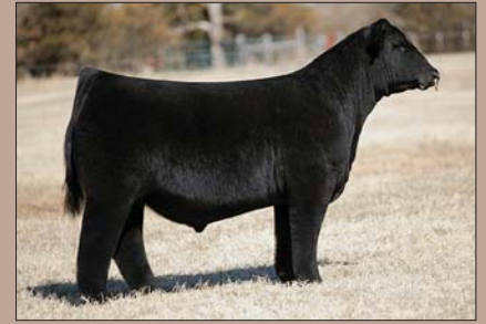
STAG Good Times 201 ET, sire of Lot 32.