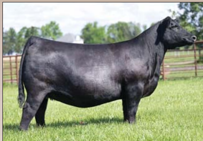
PVF Missie 0227, dam of Lot 35.