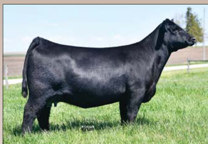
PVF Blackbird 8001, dam of Lot 44.