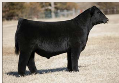
STAG Good Times 201 ET, sire of Lot 5