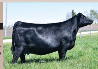
PVF Lucy 4189