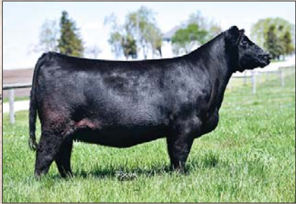
PVF Missie 6228, dam of Lot 42.