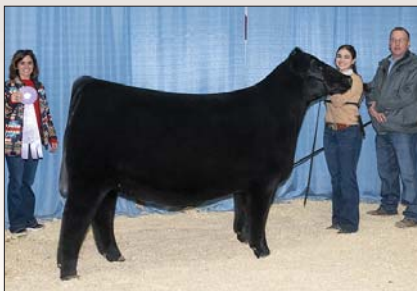
PVF Proven Queen 1033, this popular National Western Stock Show Division winner for Amelia is the dam of Lot 21-23

Retaining 1/2 embryo interest in Lot 23.