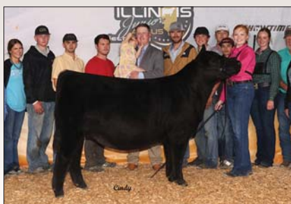
PVF SFA Missie 3071, this Supreme Champion Animal at the Illinois Junior Angus Field Day is a maternal sib to Lot 26.

Combining two of the winningest show ring families, the Sandy's and the Missie's into one pedigree, has created this April female with an outstanding show ring look, rib shape and body dimension to be a tremendous cow. 8246 consistently transmits extra ruggedness due to her sire, KR Casino 6243, and is a proven producer of show ring champions. In the past year alone, she produced PVF SFA Missie 3067, Reserve Grand Female at the Atlantic National and PVF SFA Missie 3071, Grand Champion Female of the Illinois Junior Angus Field Day.