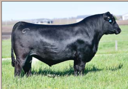
Connealy Common Ground, sire of Lot 46.