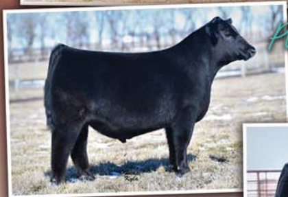
P/F Marvel 9185