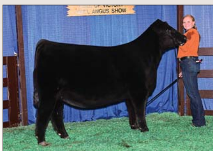
PVF Missie 1055, this North American International Livestock Exhibition Division Winner for Ashton Dillow is a full sib to Lot 20.

This top June heifer is a full sister to PVF Missie 1055, a $130,000 sale topper who went on to be named Junior Champion of the North American International Livestock Exhibition for Ashton Dillow. Progeny of Select Sires' PVF Marvel 9185 are show ring standouts for their ability to tie together extra power bone and foot size with a striking design.