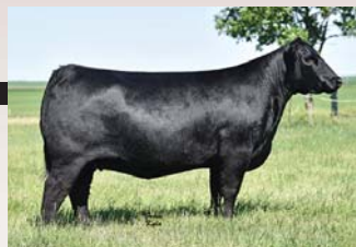
PVF Proven Queen 5186