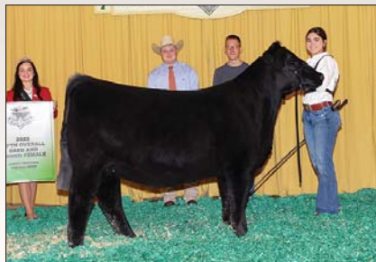
PVF Proven Queen 1033, this Top 5 Bred and Owned Female at the Atlantic National for Amelia is the dam of Lots 21-23