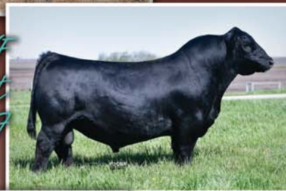
P/F Capone 2104