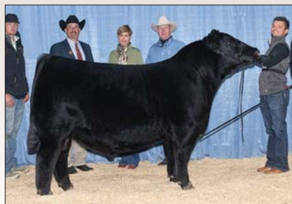
MC Caesar 3109, Grand Champion Bull, NWSS in 2025 is a maternal brother to the dam of Lot 4.