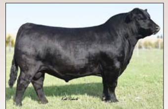
KR Casino 6243, sire of Lot 10.