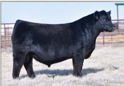
This ABS sire PVF DLX King Pin 0058 is the sire of Lots 28-29.

Offering two late summer full sisters by the ever increasingly popular ABS Sire, PVF DLX King Pin 0058, whose progeny continue to rack up banners across multiple breeds, increasing his industry impact every day. The donor dam of these females, PVF Proven Queen 5094, who is sired by our foundation Genex sire, PVF Insight 0129 is a direct daughter of the famous PVF donor, Dameron PVF Proven Queen 010. Among 5094's many accomplishments include a past $40,000 feature of a past Spring Production Sale.