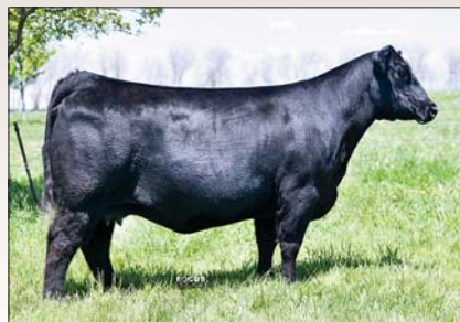
PVF Blackbird 3127, a maternal granddam of Lots 1-3.