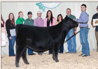
PVF Blackbird 3152, this Grand Champion Bred & Owned Female from the Eastern Regional Junior Angus Show is a maternal sib to Lot 24.