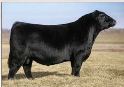
BLC/MLA Omega 2258, sire of Lot 11.