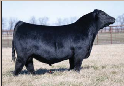
PVF Bulletproof, sire of Lot 48.